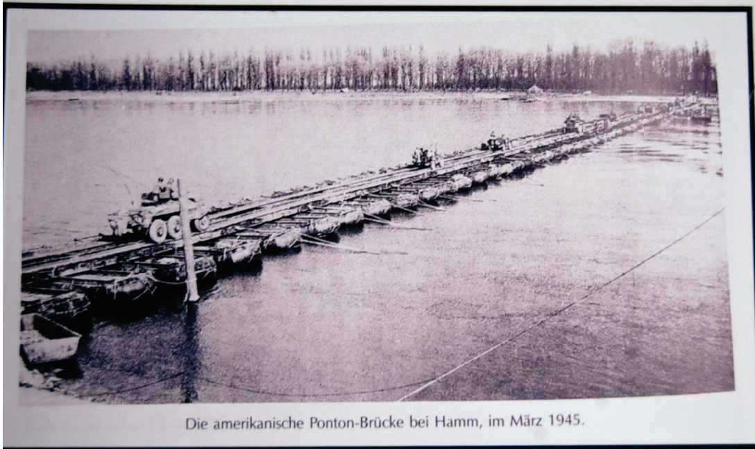
Fig. 3 M-2 Treadway Bridge across Rhine River at Hamm-am-Rhine, March 26, 1945