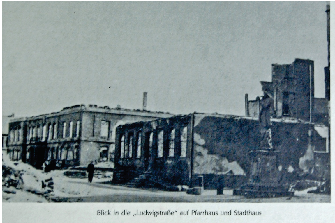
Fig. 4 Gernsheim after the bombardment of March 26, 1945.

In Gernsheim many houses were damaged by artillery fire and others burned including the town's two main churches and city hall. Sixteen citizens, from the age of three to age 68, lost their lives